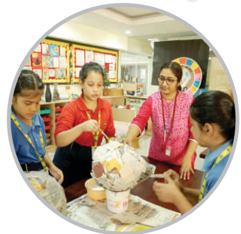
ART & CRAFT STUDIO