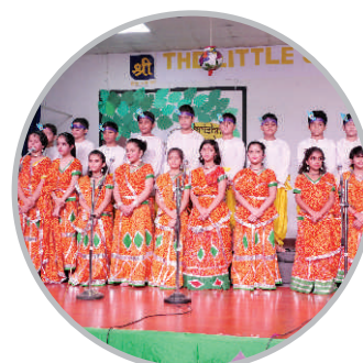
AIR CONDITIONED AUDITORIUM