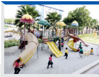
OUTDOOR PLAY AREA