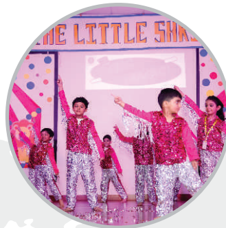
DANCE AND DRAMA