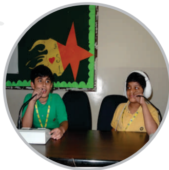
ENGLISH LANGUAGE LAB